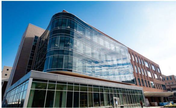
A hospital built with kids in mind