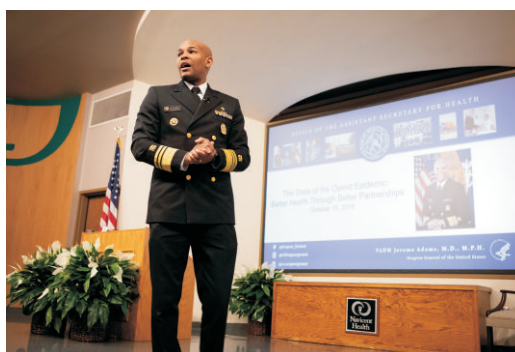
A visit from the U.S. Surgeon General to discuss opioid abuse