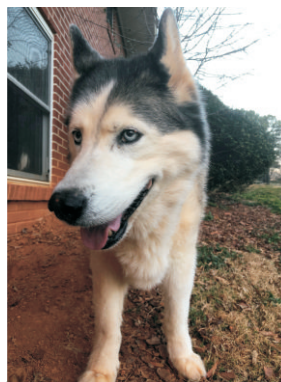
Pacemakers for man's best friend