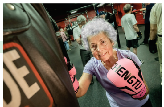
Putting Parkinson's on the ropes

Navicent Health also had direct expenditures of almost $752 million in 2018. The total economic impact of those expenditures was $1,728,903,554.00 when combined with an economic multiplier developed by the United States Department of Commerce's Bureau of Economic Analysis. This output multiplier considers the “ripple” effect of direct hospital expenditures on other sectors of the economy, such as medical supplies, durable medical equipment and pharmaceuticals. Economic multipliers are used to model the resulting impact of a change in one industry on the “circular flow” of spending within an economy as a whole.