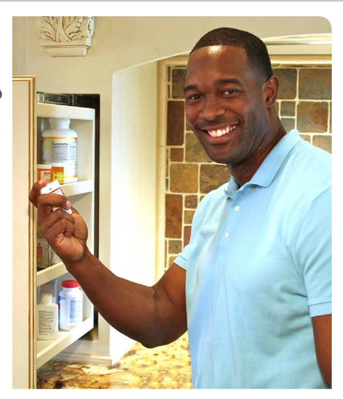
Taking your medicine the way your doctor tells you to is key to getting your blood pressure down where it belongs!

Your doctor has prescribed medicine to help lower your blood pressure. You also need to make the other lifestyle changes that will help reduce blood pressure, including: not smoking, reaching and maintaining a healthy weight, lowering sodium (salt) intake, eating a heart-healthy diet including potassium-rich foods, being more regularly physically active, and limiting alcohol to no more than one drink a day (for women) or two drinks a day (for men). Following your overall therapy plan will help you get on the road to a healthier life!